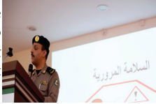
Traffic Campaign by Moror Nov 25- 2024