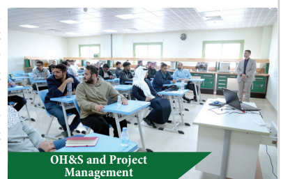
OH&S and Project Management

ITQAN Institute has launched a new program and short courses to equip professionals with critical skills and meet industry needs. These initiatives are designed to enhance workforce capabilities, fulfill industry demands, and support the development of highly qualified professionals. 9 trainees were enrolled in a One-Year Tailored Program on Pressure Vessel Vendor Inspector Assistant and 120 trainees in a Short Course Program on Occupational Health & Safety (OH&S) and Project Management (PM).