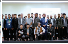
Anti-Drugs Campaign Dec 12- 2024