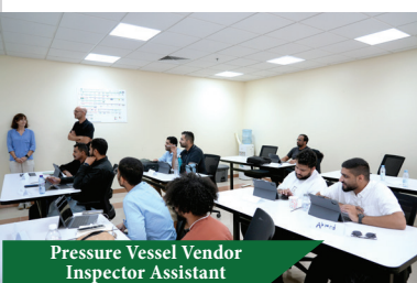
Pressure Vessel Vendor Inspector Assistant

ITQAN Institute has launched a new program and short courses to equip professionals with critical skills and meet industry needs. These initiatives are designed to enhance workforce capabilities, fulfill industry demands, and support the development of highly qualified professionals. 9 trainees were enrolled in a One-Year Tailored Program on Pressure Vessel Vendor Inspector Assistant and 120 trainees in a Short Course Program on Occupational Health & Safety (OH&S) and Project Management (PM).