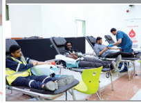
Blood Donation Dec 01- 2024