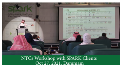
NTCs Workshop with SPARK Clients Oct 27, 2021, Dammam