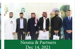
Nesma & Partners Dec 14, 2021