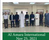
Al Amara International Nov 25, 2021

Objective: To develop collaborative ties between all currently active sponsoring companies, trainees and ITQAN.