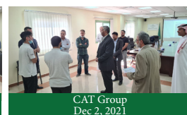
CAT Group Dec 2, 2021