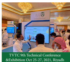
TVTC 9th Technical Conference & Exhibition Oct 25-27, 2021, Riyadh