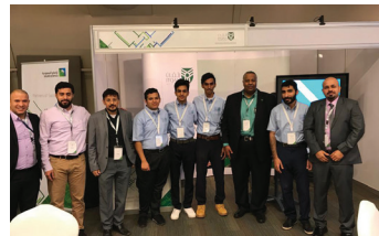
2018 SA Community Services Contractors Forum in Ithra, Dhahran