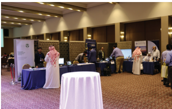
2018 SA Operation Inspection Technical Forum in Carlton Hotel, Khobar