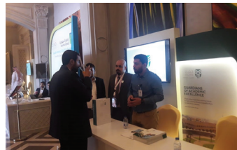
2018 SA Quality Forum in Kempinski Hotel, Khobar