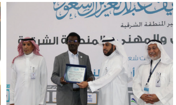
2019 TVTC Eastern Province Forum in Dammam