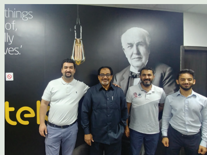
Intertek Company (C-IV)