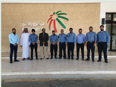
Petro Rabigh Company (C-I & C-II)

Starting January 2019, ITQAN team conducted OJT follow-up visits with the 4th Cohort October 2018 graduates.