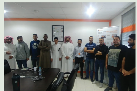
SGS Company (C-IV)